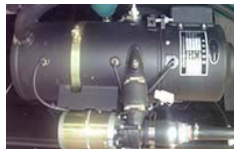
Diesel powered heater