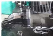
220V water heater